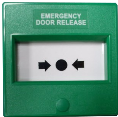
CALL POINT FRONT