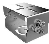
DS-1706ZJ PT joint