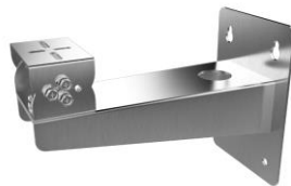
DS-1704ZJ Wall mount