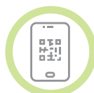
QR CODE SCANNER