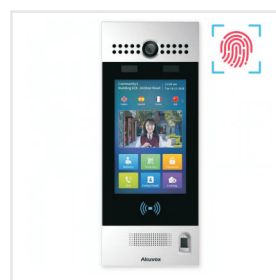
Akuvox - R29CT SIP Touchscreen Intercom with Face Recognition, Voice Commands and Fingerprint Reader