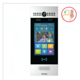
Akuvox - R29C-B SIP Touchscreen Intercom with Face Recognition, Voice Commands and Thermal Detection