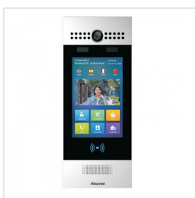
Akuvox - R29C SIP Touchscreen Intercom with Face Recognition, Voice Commands and QR Code Scanner