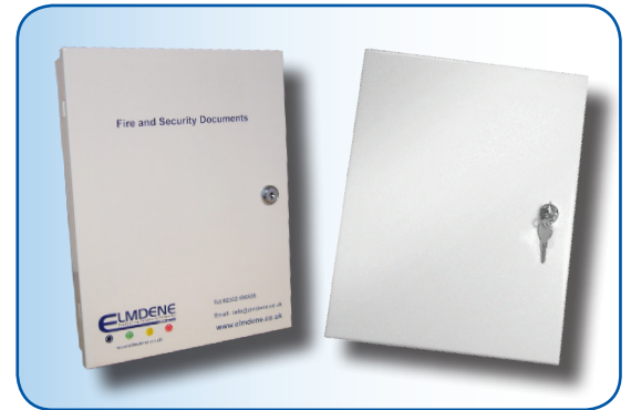
A4-DOC-BOX (optional customer screen printing)