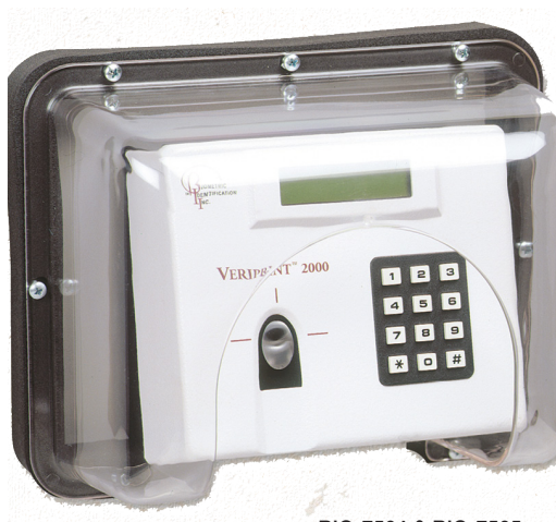
BIO-7504 & BIO-7505