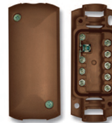
Also available in brown

REAR CABLE ENTRY TO SUIT 2 x 8 CORE CABLES