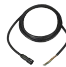
WV-QCA502 I/O Cable for Aero PTZ camera