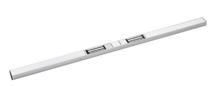
Shown complete with maglocks