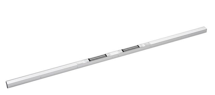
Shown complete with magnets

Slim architectural housing for use on double doors. Provides an aesthetically pleasing method of installing maglocks above the doorway. Includes door status monitoring contacts for each door leaf. Requires 2 x EM00 or EM00R maglocks.