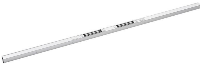
Shown complete with maglocks

Slim architectural housing for use on double doors. Provides an aesthetically pleasing method of installing maglocks above the doorway. Requires 2 x EM00 or EM00R maglocks.