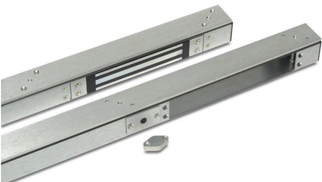
Image shows both standard and DS versions