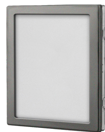
4846/BL Gun metal grey