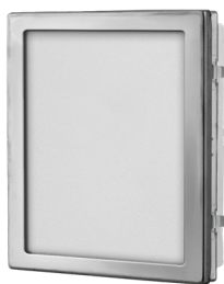
4846/S Mirror stainless steel