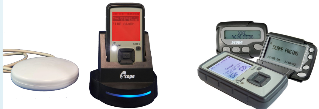
Optional Nightstand Kit for hard of hearing (See EPOC Nightstand Datasheet)

Tel: +44 (0) 1803 860700 Fax: +44 (0) 1803 863716 Web: www.scope-uk.com Email: sales@scope-uk.com