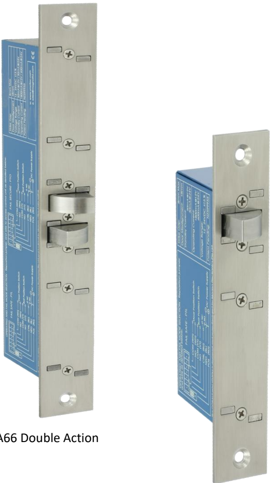
ADA66 Double Action