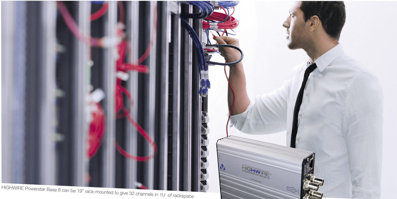
HIGHWIRE Powerstar Base 8 can be 19" rack-mounted to give 32 channels in 1U of rackspace