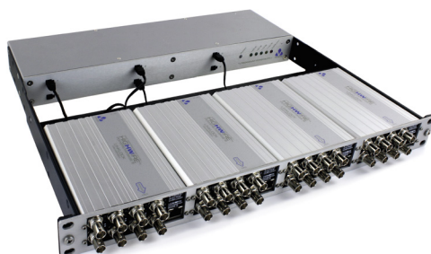
Rackmount | Four rack-mounted HIGHWIRE Powerstar Base 8 units assembled with a Veracity 1U PSU.