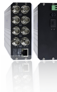
Front | 8 coax links with status LEDs, plus a Gigabit uplink port.