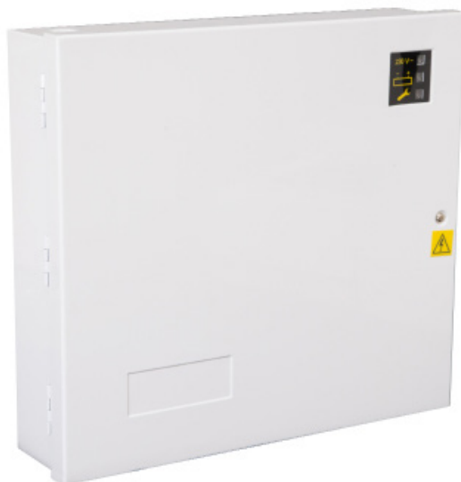
12 & 24v Monitored Power Supplies