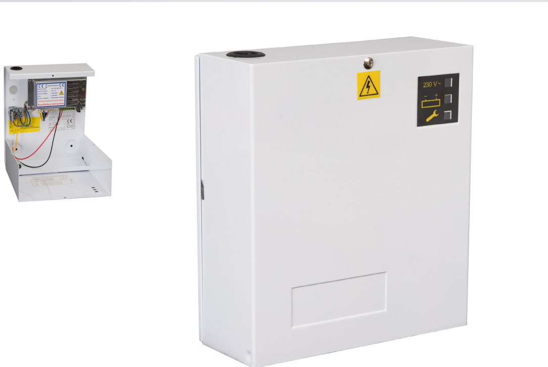
12v Power Supply