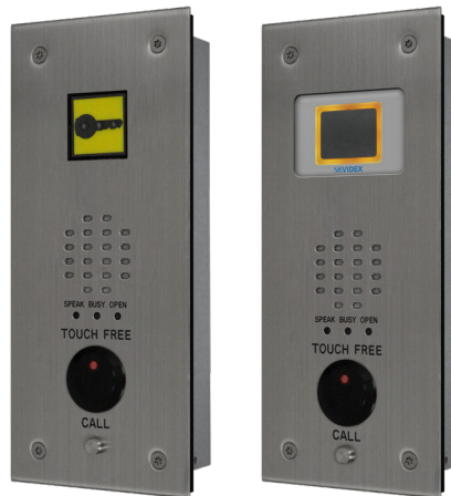
VR120 AUDIO NT SERIES + PROXIMITY