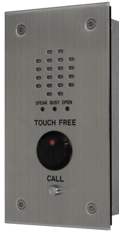
VR120 AUDIO NT SERIES