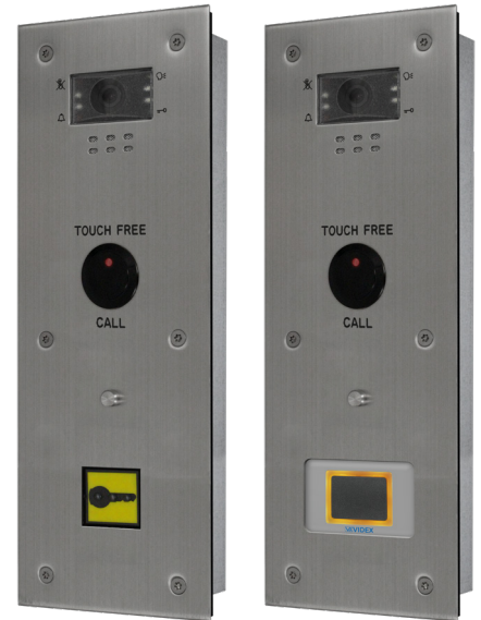
VR130 VIDEO NT SERIES + PROXIMITY