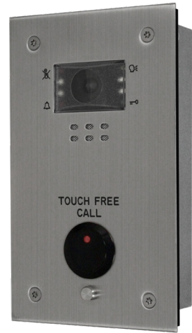
VR130 VIDEO NT SERIES