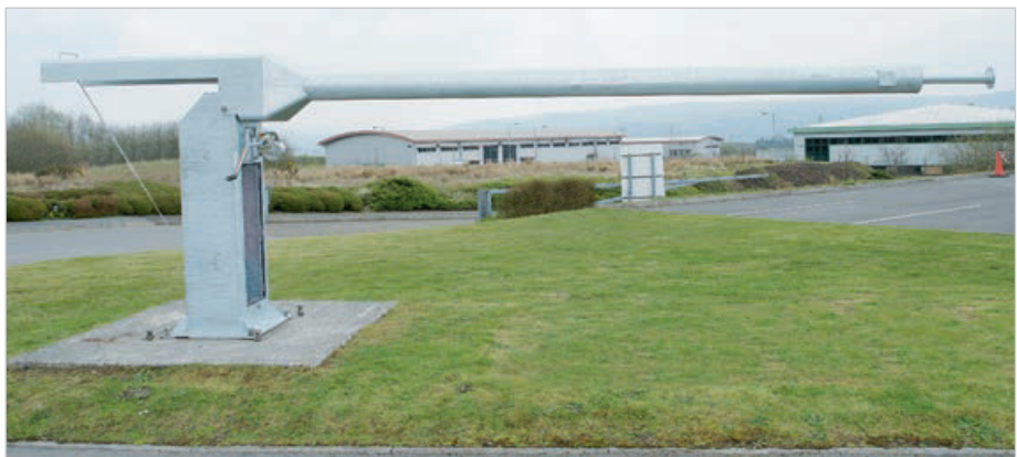
AW1545/6TD/UP in tilted position